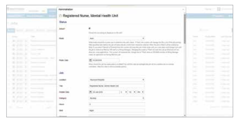
The Heywood Healthcare job portal.

Though the idea of LEAN thinking has its origins in the automobile industry in the early 1990s, its principles have been adapted beyond manufacturing, distribution, retail, construction, maintenance, government, and of course, healthcare. Today, the state of healthcare is more regulated than ever, resulting in a direct effect on reimbursement for services rendered. Heywood Healthcare Leadership recognizes the need to make strategic improvements in all areas to ultimately remain financially viable. Providing quality healthcare at the bedside is not enough to sustain a healthcare organization in today's market. Heywood Healthcare strives to continuously improve processes across all service lines, working toward our goal: to be one of the best independent community hospitals in America.